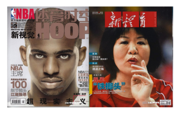
Fig. (4). Figure for the domestic sports professional publications.

Professional magazines or sports team internal information briefing, training and competition and the technical observation and other fieldwork is coaches get sports competitive intelligence the main ways and methods, the mean scores for 4.11 and 4.01, the breakdown of the first and second place (Fig. 4).