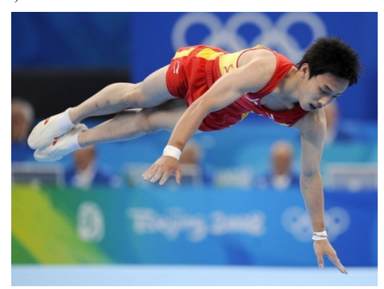
Fig. (1). Zou Kai in the 2008 Olympic Games in the gymnastics competition.

With its own unique physical characteristics of the industry and sports specific projects, from the enterprise competition intelligence theory research and practice achievements derived sports competitive intelligence and combining the competitive intelligence and competitive sports practice, mining the project winning rules in the sport of competitive intelligence characteristics, study of sports competitive intelligence how to cultivate and enhance the core competitiveness of weightlifting, gymnastics and other project process and the realization mechanism of the, the paper makes a summary of the sport of competitive intelligence is the project to build the best strategy for the core competitiveness (Fig. 1).