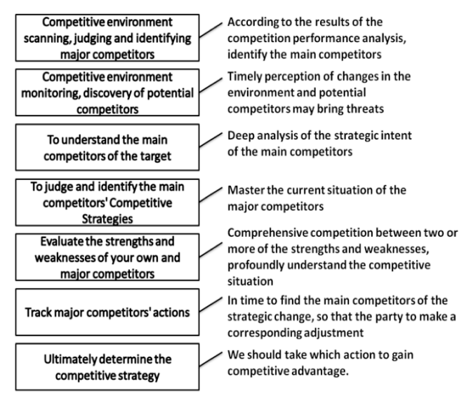
Fig. (2). Schematic diagram of competitive intelligence analysis frame

The main competitors are our focus on the object. But in sports practice, we should not ignore some potential competitors, sometimes potential competitors may be more threatening. Many outstanding athletes in major events were eventually defeated by some of the new, rather than the current major competitors are more examples.