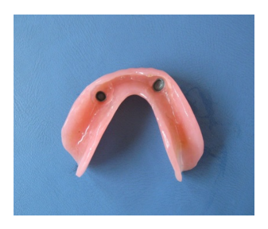
Fig. (2). Outer telescopic crowns attached into denture base.