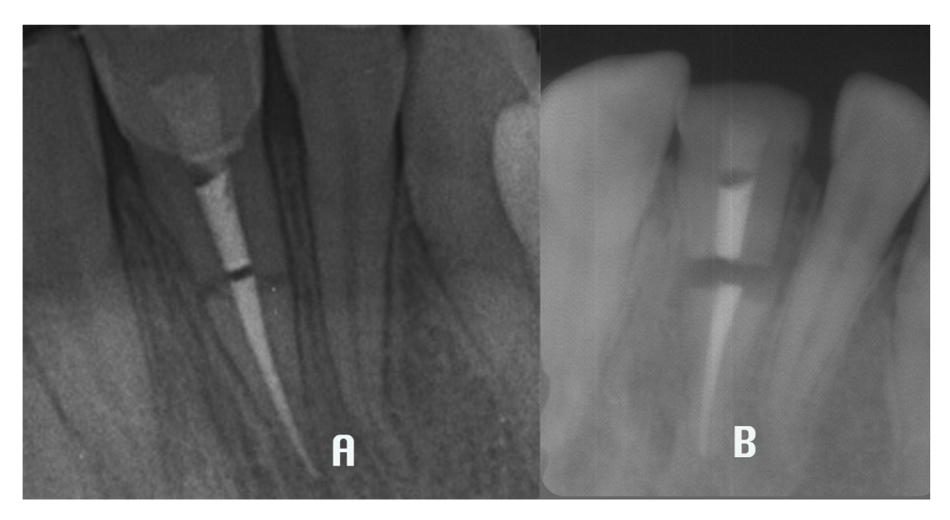
Fig. (4). Rx follow-up: Root fracture line widening A) 12 months follow-up B) 36 months follow-up.

The age was the only numerical variable and it was expressed as mean, standard deviation, median, minimum and maximum; the categorical variables were expressed as numbers and percentages. The non-parametric approach was used because of the low sample size. The Cochran test was applied in order to evaluate the existence of significant differences for the presence of diastasis, inflammation, mobility, sensitivity and pulpal lesions in four different times (basal, 6, 12 and 36 months). The Mc Nemar test was estimated to perform statistical comparison between two consecutive times for each parameter. In order to evaluate the association between sex, fracture, dislocation, repositioning and splint with presence/absence of diastasis, inflammation, mobility, sensitivity and pulpal lesions (for each time), the Pearson's P square was applied; alternatively, the exact Fisher test was estimated, when a frequency in the contingency table was less than 5. P<0,050 two sided was considered to be statistically significant. Statistical analyses were performed using SPSS 17.0 for Window package.