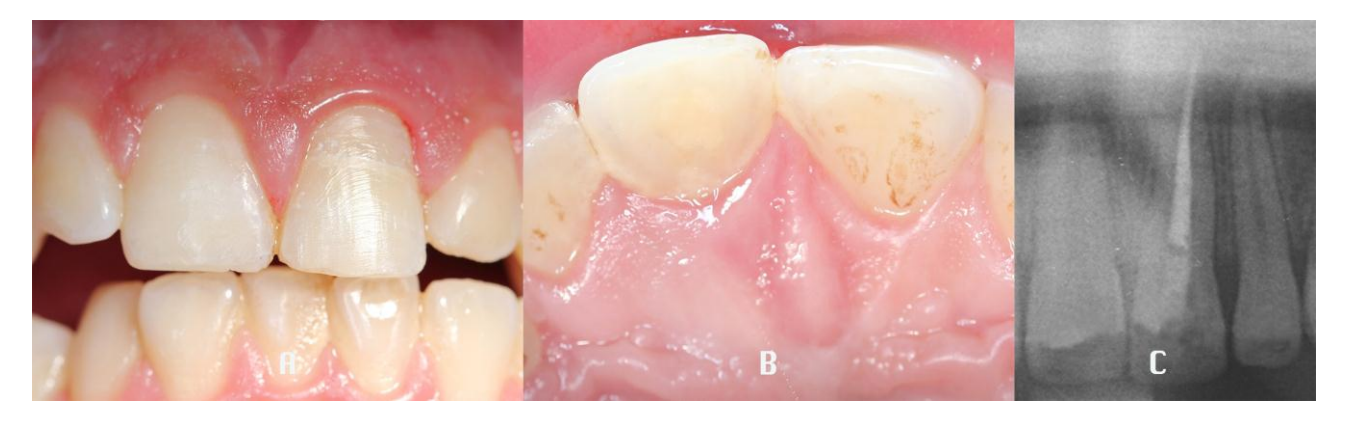
Fig. (3). Six months follow-up A) Buccal view B) Palatal view C) Intraoral Rx.