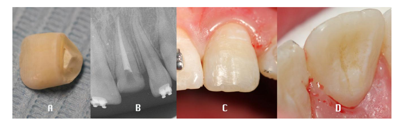
Fig. (2). Treatment plan: A) Coronoplasty of the coronal fragment B) Endodontic treatment C) buccal view of the repositioned coronal fragment D) palatal view of the repositioned coronal fragment.