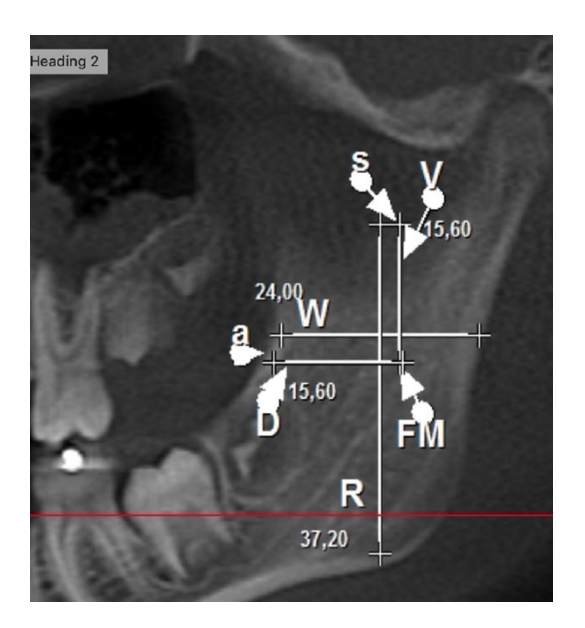
Fig. (1). Pattern of tomographic measurements used in the study (Wmandibular ramus width; D- distance from mandibular anterior border to mandibular foramen; R- Height of mandibular ramus; V- Distance from mandibular notch to mandibular foramen; FM- mandibular foramen; a- Deepest point of anterior mandibular border; s- Lowest point of mandibular notch.

Table 6 shows the values of W, D, R and V, as well as W/D and R/V, considering all facial forms together or separately. The values of W/D were not correlated with those of R/V in any of the facial forms or in the whole group of patients. This indicates that there is no important association between height and width of the mandibular ramus. This finding was the same for all the measures assessed, regardless of facial form.