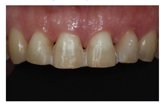
Fig. (12). Preparation of the central incisors for labial veneers.

The final outcome satisfied the patient both from the functional and esthetic point of view. She was also pleased that she could maintain her existing natural teeth without feeling the functional difficulties that she had prior to treatment. The patient continued the 3-months recall program, and the clinical situation was stable after 7 years. During this period, no detachment was noticed. (Figs. 15 & 16). There was a need for root canal treatment of teeth #21, 22 that were performed through the disilicate lithium restoration and the access holes were covered by composite fillings.