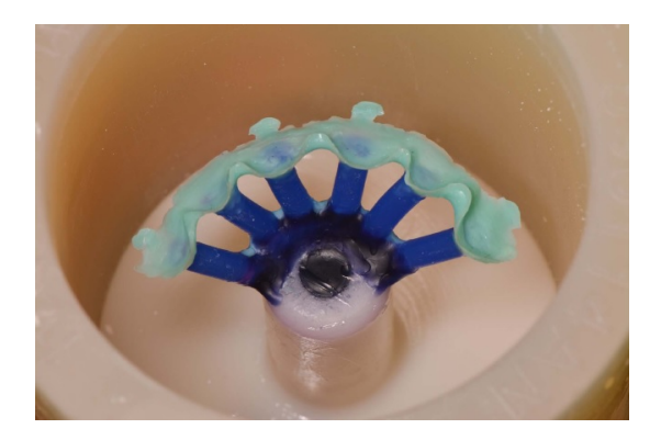
Fig. (6). The wax pattern embedded for heat-pressing.