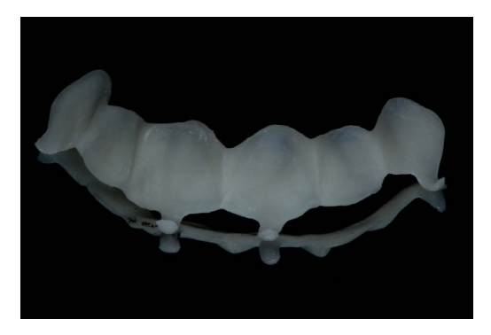
Fig. (9). The glass ceramic splint after etching.

After the final cementation of the palatal splint, the central incisors were prepared following the minimal invasion technique. Two ceramic veneers were fabricated using glass-ceramic (IPS Empress, Ivoclar Co) in the staining technique