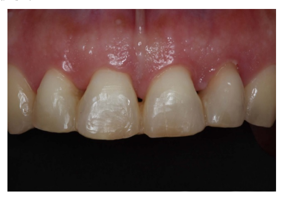
Fig. (10). Clinical situation after cementation.

and were cemented following the same laboratory and clinical procedure (Figs. 12-14). Four veneers were proposed to the patient, but she decided only for the central incisors for economic reasons. A night guard was given to the patient for night use to avoid uncontrolled forces caused by eventual bruxism.