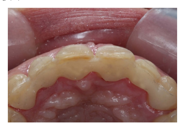
Fig. (11). The glass ceramic splint after cementation.

The final outcome satisfied the patient both from the functional and esthetic point of view. She was also pleased that she could maintain her existing natural teeth without feeling the functional difficulties that she had prior to treatment. The patient continued the 3-months recall program, and the clinical situation was stable after 7 years. During this period, no detachment was noticed. (Figs. 15 & 16). There was a need for root canal treatment of teeth #21, 22 that were performed through the disilicate lithium restoration and the access holes were covered by composite fillings.