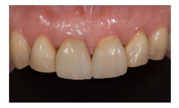
Fig. (15). Clinical situation at the 7-years recall (frontal view).