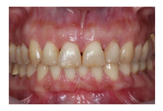
Fig. (2). Initial clinical situation at maximal intercuspation.