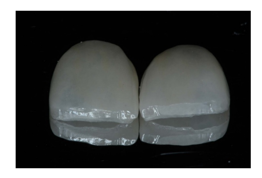
Fig. (13). The veneers prior to cementation.