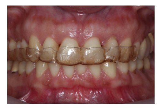
Fig. (4). The heat-vacum formed sheet that served as provisional splinting.

The initial treatment plan proposed to the patient was the extraction of maxillary incisors #12,11,21,22 and placement of two implants in the sockets of the laterals for a fixed 4 unit restoration supported on implants. The second proposed treatment plan was a fixed all-ceramic 6-unit restoration supported on the canines. Although the severity of the case and the age of the patient indicated a treatment plan with a longterm prognosis, the patient denied the extractions and asked for a treatment plan, including the maintenance of the existing teeth. Therefore a more conservative treatment plan was proposed that demanded the splinting of the anterior teeth. A factor complicating further the clinical procedure was the diastemas between the teeth and the high esthetic demands of the patient. Partial coverage splinting with metal reinforcement would definitely compromise the esthetic appearance and would lead to an unacceptable result.