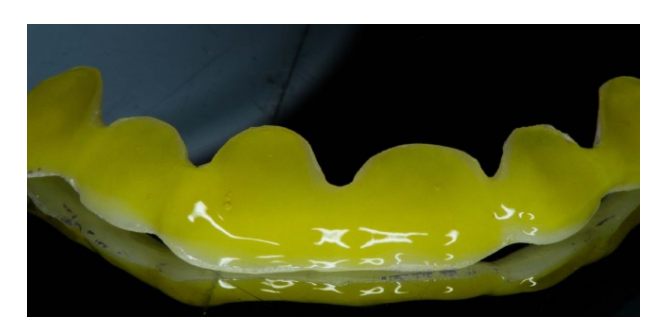
Fig. (8). Etching of the inner surface of the splint.