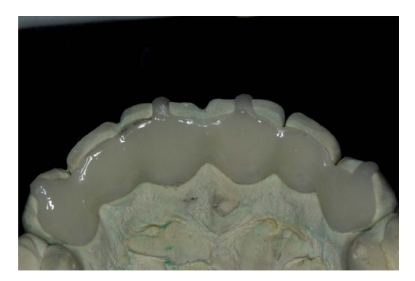
Fig. (7). The glass ceramic splint after staining.