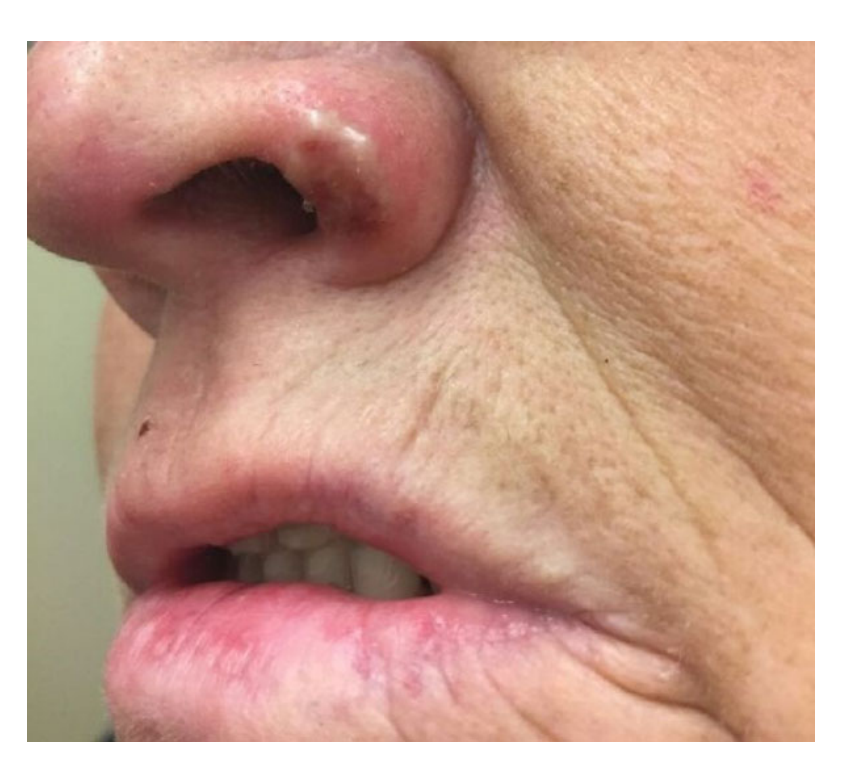
Fig. (2). left nostril.