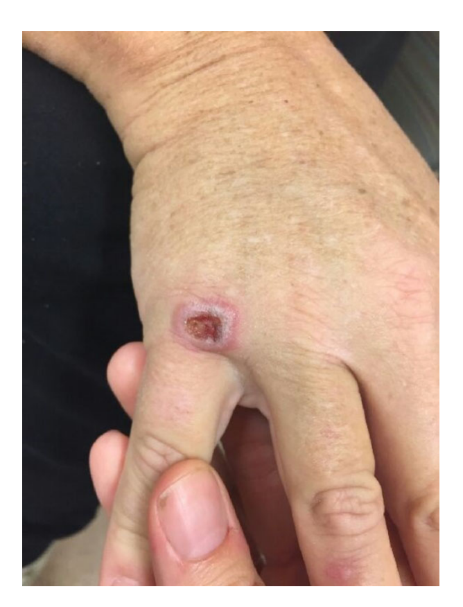
Fig. (3). Right fifth metacarpal phalangeal joint.

She was briefly lost to follow up and was seen 6 weeks later. The patient reported compliance with corticosteroid therapy and resolution of the lesions after course completion. On examination, resolution of the lesions on her hands and face was noted, with some mild scarring on her hand. She reported no new lesions at this time. She was instructed to follow up as needed and if any new ulcerations developed.