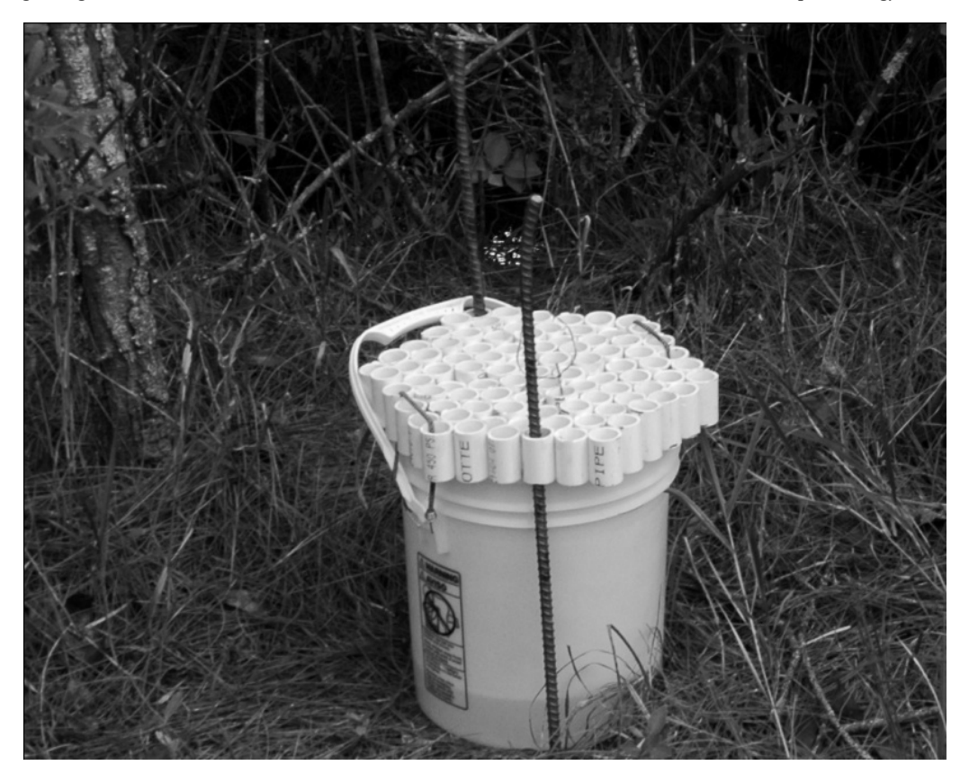
Fig. (3). A baffled-lid weevil trap secured with steel rebar at a collecting site.

1992; Fig. 3 ). Traps were baited with Cruentol<sup>®</sup> (Chemtica International, Costa Rica), a synthetic aggregation pheromone, and Weevil Magnet<sup>®</sup> (Chemtica International, Costa Rica) to simulate the volatiles produced by damaged or stressed palm tissue (Giblin-Davis et al. 1994). Each bucket was filled with 4.7 L (1 gal.) of water mixed with dishwashing detergent to quickly drown weevils caught in the trap. Two 75.6 (30 in.) sections of 1.3 cm (0.5 in.) steel rebar were used to secure the baffled lid to the trap by inserting the rebar through two outside pieces of the lid and into the ground (Fig. 3 ).