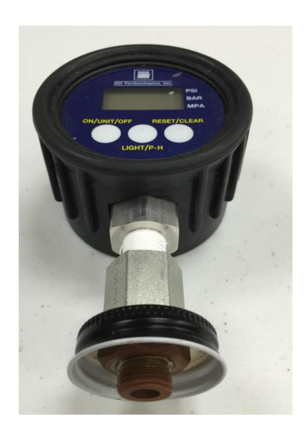
Fig. (5). Detail of pressure guage sensor attachment to a screw-on container cap.

Fig. (4). Pressure gauge integrated with container cap to measure headspace pressure of a bottle.