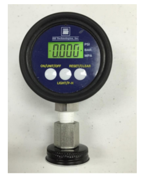
Fig. (4). Pressure gauge integrated with container cap to measure headspace pressure of a bottle.

The head space pressure of the bottles was measured using a touch type gauge (model 1706210252, SSI technologies, Janesville, USA). The gauge was mounted on a screw type metal lid (Figs. 4 and 5) which was directly placed by hand on the BBQ bottle after the dose of liquid nitrogen was applied.