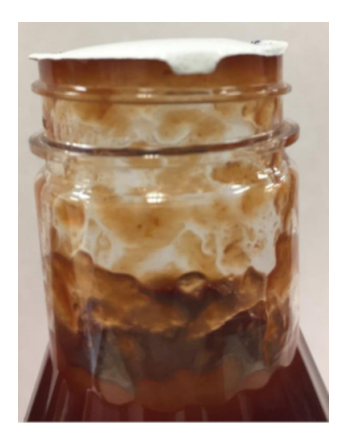
Fig. (6). Convex seal resulting from excessive headspace pressure due to the liquid nitrogen dose.

Label application and appearance were evaluated as acceptable if the label around the bottle was uniform. Shape of the foil seal was also considered in determining the optimum pressure. A bulged appearance (convex shape), as shown in Fig. (6), was rated as unacceptable.