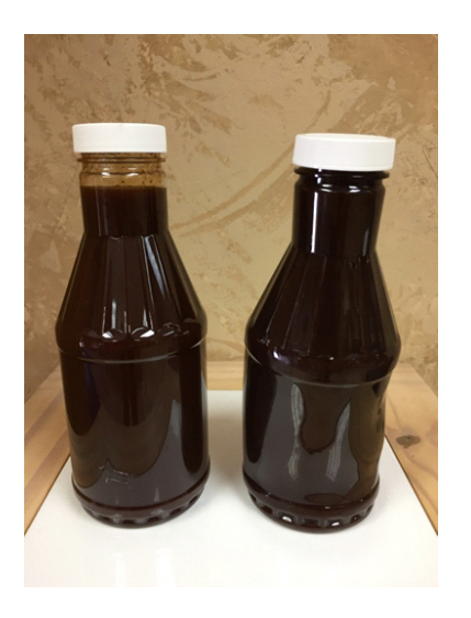
Fig. (1). Ordinary plastic bottle of BBQ sauce (left) and paneled (deformed) plastic bottle of BBQ sauce (right).

The demand for processed food with a longer shelf life is continuously growing. New methods of packaging are in use and being developed to accommodate longer shelf life. Newer packing methods include aseptic, hot filling [2] and modified atmosphere packaging (MAP). MAP uses combinations of gases like nitrogen, oxygen and carbon dioxide, depending on the food products packaging material and configuration.