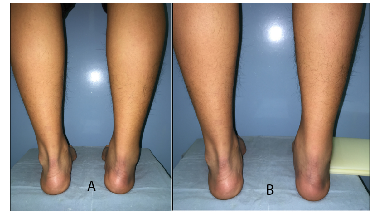
Fig. (2). The same patient as in Fig. (1), seen from behind. Varus alignment of the right heel (A) is corrected by Coleman block test (B).

While severe cavus foot can be easily determined, a subtle cavus deformity requires careful inspection of the foot with high threshold of suspicion. A "peek-a-boo heel sign [13]" is gaining popularity as a sign of heel varus determined by mere observation from the front. With the patient standing with the feet at shoulder width apart and the medial borders of the hallux of both feet in parallel alignment, any appearance of the medial border of the heel is considered a sign of heel varus (Fig. 1C). This sign is not present when there is valgus or neutral hindfoot position. Heel varus is then confirmed from the rear (Fig. 2A) to rule out any possible false positive peek-a-boo sign due to a very large heel pad or severe metatarsus adductus with externally rotated lower extremities.