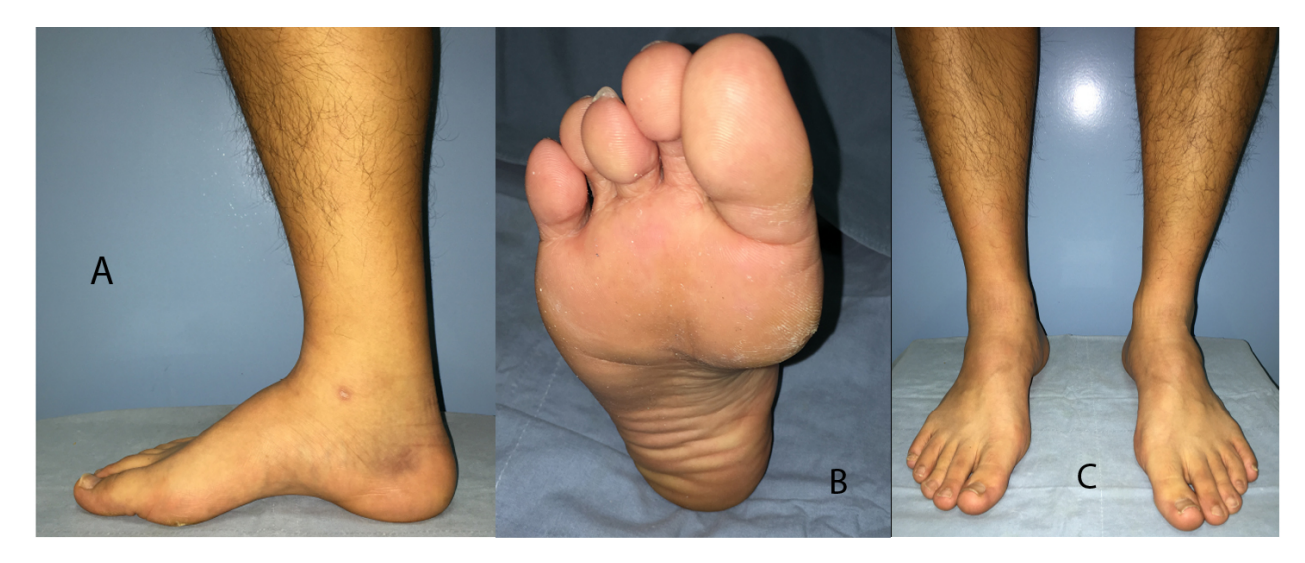
Fig. (1). A 19 year-old male patient presented with recurrent ankle sprains on the right side. Elevated medial longitudinal arch is indicative of a cavus foot ( A )M. Depressed 1^{st} metatarsal head can accompany plantar callus ( B ). Observation of the medial border of the heel from the front, a positive peek-a-boo heel sign, is suggestive of heel varus ( C ).

1B ), callosity under first or fifth metatarsal heads, thickening or callosities over the lateral border of the foot may be present in a cavus foot.