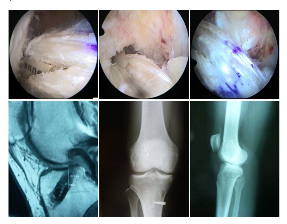
Fig. (3). AperFix technique.

sible for the impingement of the graft against the roof of the intercondylar roof [12]. The guide pin was inserted approximately 2-2.5 cm medial to the tibial tuberosity to approximately 6-8 mm anterior to the posterior cruciate ligament with an angle of 55^{\circ} - 65^{\circ} with respect to the medial joint line of the tibia. After the tibial tunnel was rasped, the femoral guide pin was inserted using the femoral offset guide which was selected according to the graft thickness, preserving 1.5-2.0 mm thickness of the posterior femoral cortex. In the first group (Group A), a suspensory femoral graft fixation with RetroButton (Arthrex, Inc, Naples, FI.) device was used in 43