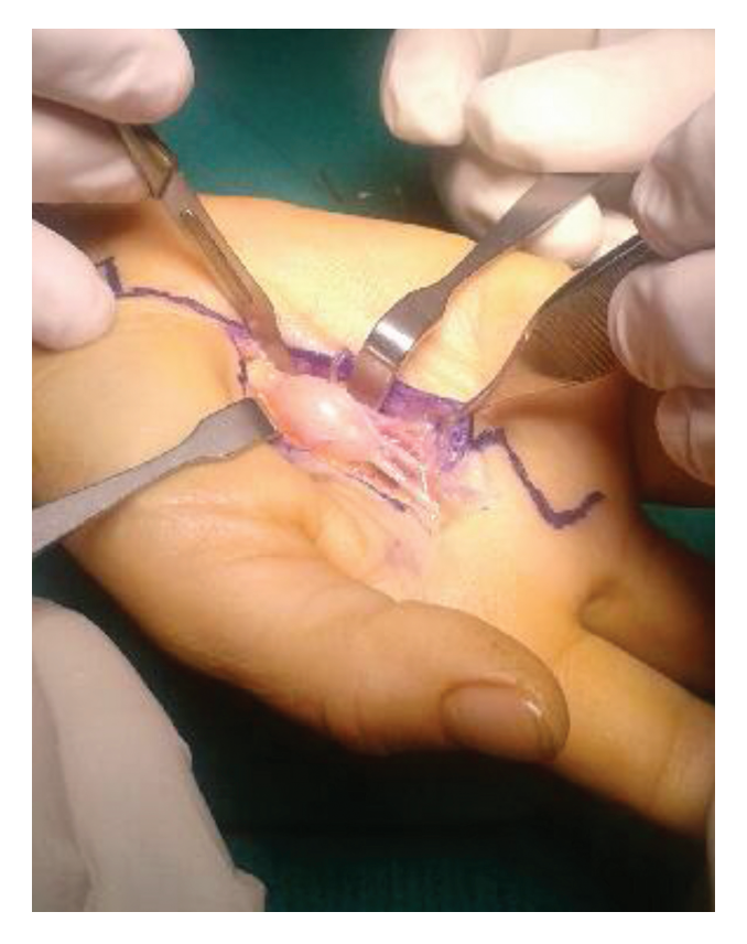
Fig. (3). Intraoperative photo of common digital nerve Schwannoma.