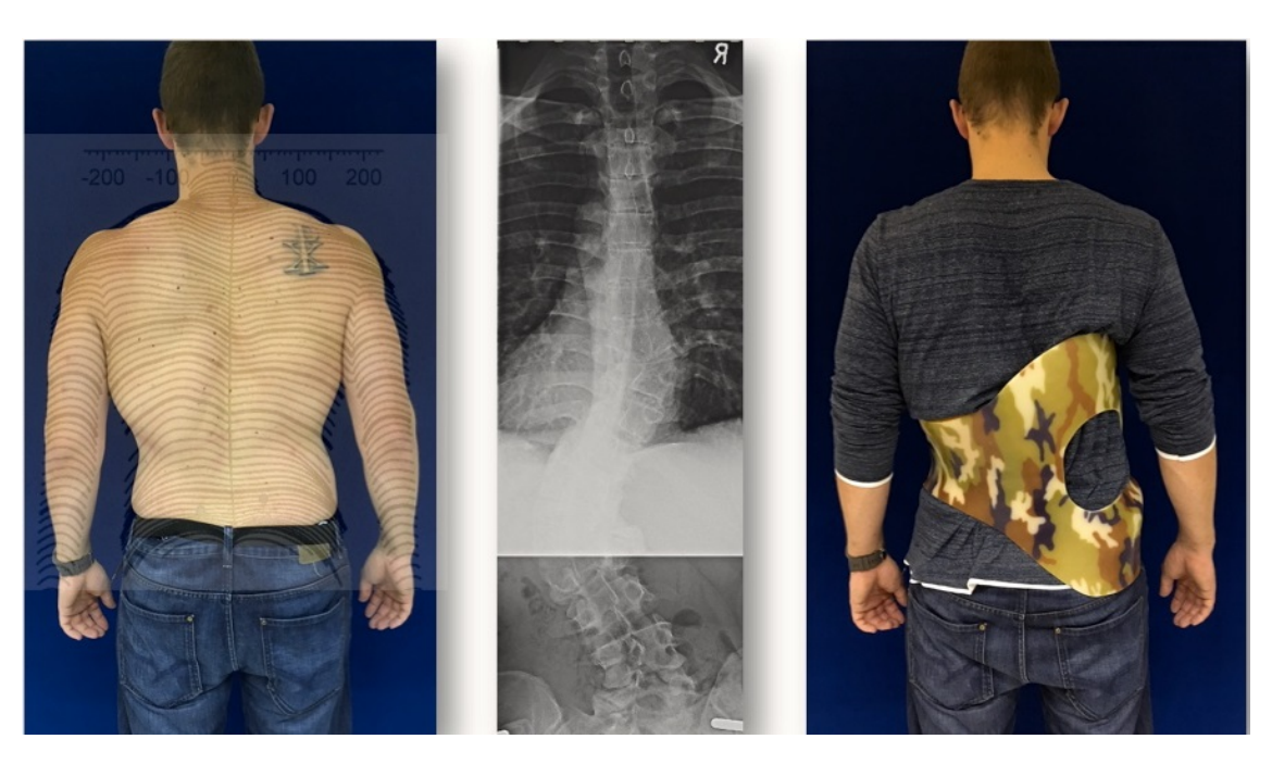
Fig. (2). The patient at his last presentation with a good balanced posture (left picture with surface topography overlay), the final x-ray (middle) and a picture with the brace on he uses when he has pain (right).