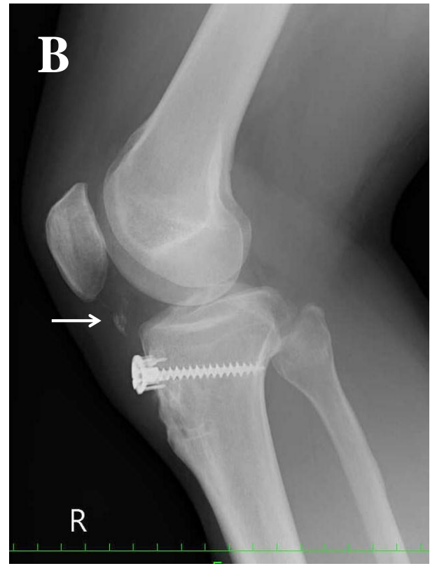
Fig. (4). (A) Sagittal section of T2-weighted MRI and a lateral plain radiograph of the right knee at the six-month follow-up. (B) Twelve-month follow-up plain radiographs of the right knee. Bone union with ectopic patellar tendon ossification (small white arrow).