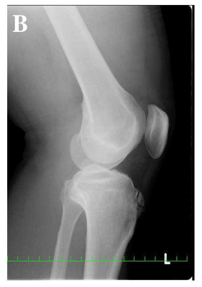
Fig. (1). Lateral plain radiographs of both knees. A: right knee, B: left knee. An avulsion of the tibial tuberosity (arrow) and high riding patella were observed (A). A trace of Osgood-Schlatter disease was observed (B).