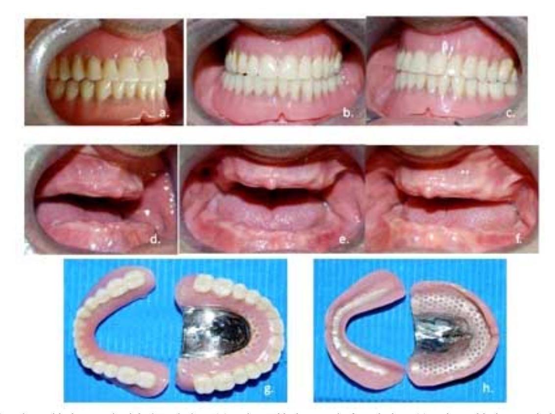
Fig. (1). (a) patient with dentures in right lateral view; (b) patient with dentures in frontal view; (c) patient with dentures in left view; (d) patient without dentures in right lateral view; (e) patient without dentures in frontal view; (f) patient without dentures in left lateral view; (g) dentures viewed from below; (h) dentures viewed from above.

So, the patient's visit at School of Dentistry, University of Foggia, was the additional step taken to further evaluate this case. Many intra- and extraoral conditions have an association with risk for SRBD that warrant in-depth consideration. The patient showed a micro-uvula, a flat palate, a tonsils score of I (the standard grading system for the tonsils rates them on a scale from 0 to IV, with 0 indicating that the tonsils are absent and grade IV indicating they are grossly enlarged [21]) and a large tongue with a Mallampati score of III (the Mallampati score assesses tongue position relative to the soft palate as well as visualization of the oropharynx as indicators of the risk for