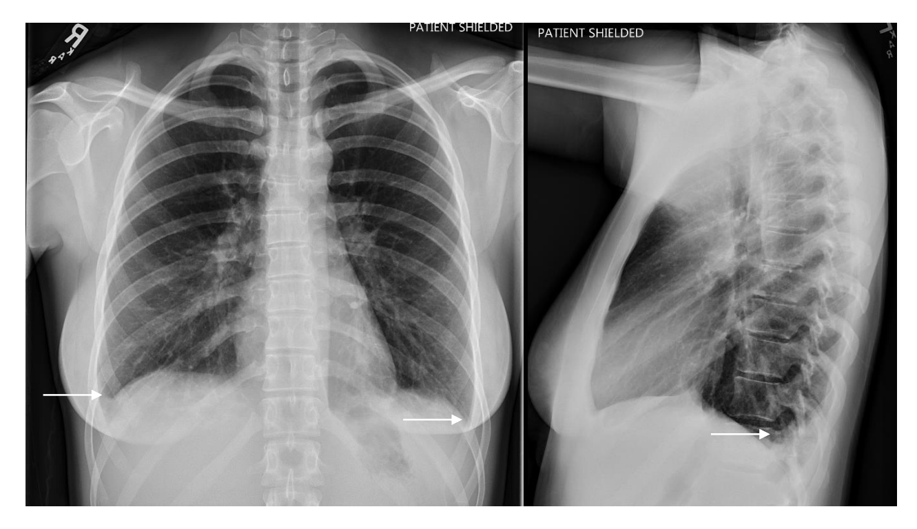
Fig. (1). PA-lateral chest x-ray on admission. Arrows highlight small bilateral pleural effusions.