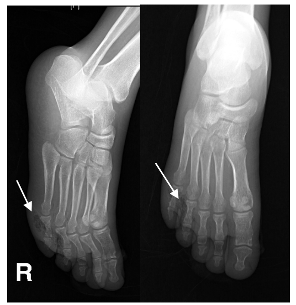
Fig. (1). X-ray showing subcutaneous gas overlying the right distal lateral foot

showed gas within the soft tissues of the fourth and fifth toes (Fig. 1). MRI of same area revealed mild marrow edema in second, third and fourth proximal phalanges (Fig. 2). On the second day of admission, the patient underwent debridement. Due to the findings on the x-ray, halophilic Vibrio was suspected. Therefore, the antibiotic regimen was reviewed and modified to include doxycyclin 100mg IVBP BID, imipenem 500mg IVBP Q6h, and clindamycin 600 mg IVBP Q8h.