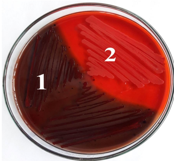
Fig. (1). Biofilm production by S. aureus ; 1: Non-producer, 2: Strong producer and on Congo Red Agar.

S. aureus is a common pathogen associated with pyogenic infections and remains a versatile and potent pathogen in human [21]. In this study; 19.3% (110/570) samples showed growth of S. aureus which is almost similar to that of Belbase et al. (2017) which showed 20.37% and 20.9% growth of S. aureus respectively [15]. However, in other studies showed 51.52% and 30.40% of S. aureus respectively, which were comparatively higher rates than that of the present study which may be because of large sample size and long study period [4, 22]. In this study, the rates of infection in indoor and outdoor patients were 46.36% and 53.64% respectively which were comparable to the study of Belbase et al. (2017) as inpatients (43.4%) and outpatients (56.6%) [15]. The infection was higher within the age group of 20-30 years (32.7%) and lower at 10-20 years (14.5%) and \geq 60 years (10%). But in the other studies, the rates of S. aureus were higher in the age group \leq 10 years which were 24% and 49.1% respectively [4, 23].