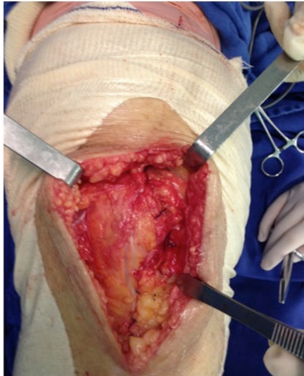
Fig. (4). Closing of the joint capsule.

use of dipyrrone. All patients received as prophylaxis for deep venous thrombosis a dose of 40 mg of enoxaparin 12, 24 and 48 hours after surgery and were prescribed 10 mg Rivaroxaban daily for 10 days at home. Antibiotic prophylaxis was achieved with 2 g intravenous cefazolin during anaesthetic induction and 1 g of cefazolin every 8 hours for 48 hours. The dressing was changed in the hospital on the 2 nd postoperative day, every day at home and at the clinic on the 7 th day. The stitches were removed on the 21 st postoperative day. Patients used a walker for 21 days with a full load from the 2 nd postoperative day. Physical therapy was also initiated on admission and was maintained until the second month, postoperatively, 3 times a week with a physical therapy protocol focusing on analgesia, gain in flexion and walking training. Radiological knee examinations were performed in the immediate post-operative period and upon return to the clinic 2 months later.