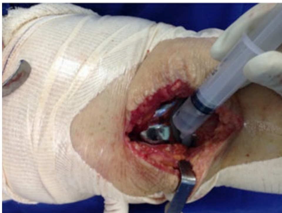
Fig. (3). Application of tranexamic acid before capsule closure.

The surgical technique was used documented within the current literature, with subarachnoid anesthesia, patellar medial access and application of TXA all over the exposed joint in the selected cases using a syringe (Fig. 3) and maintained for 5 minutes. After this period, the joint capsule and incision were closed without drain (Fig. 4). All procedures were performed by the same surgeon and with the same instrument and implant (Meta Bio Ltd., Rio Claro, São Paulo, Brazil).