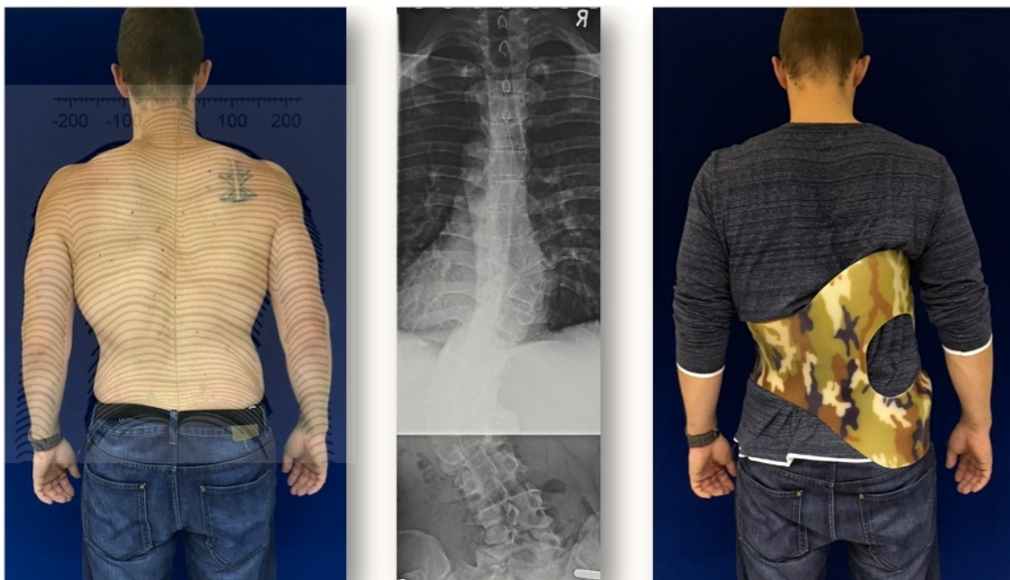
Fig. (2). The patient at his last presentation with a good balanced posture (left picture with surface topography overlay), the final x-ray (middle) and a picture with the brace on he uses when he has pain (right).